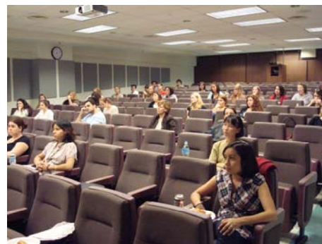
Attendees at a WIS seminar