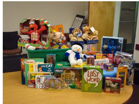
Toys donated for Toys for Tots

Every year, Women in Science holds two collection drives to benefit the Richmond community: Toys for Tots and Cinderella Dreams. WIS held the Toys for Tots drive this December and many toys were donated. We thank everyone who participated and due to this generosity, local children were able to have a happy holiday season this year. In the spring, WIS will hold a prom dress drive sponsored by Cinderella Dreams. Last year many items were donated including formal dresses, shoes, purses and jewelry. Once donated to Cinderella Dreams, these items are available to high school students who do not have a dress to attend their high school prom. Thanks again to everyone who contributed!