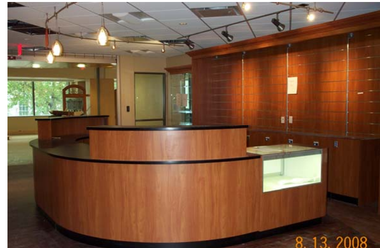
New Gift Shop