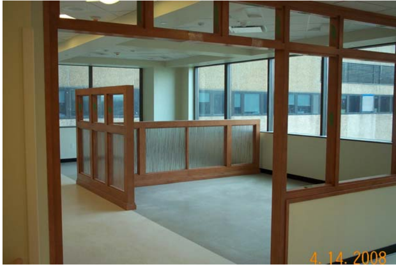
Waiting area on units