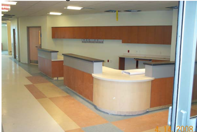
Burn Unit Nurse Station