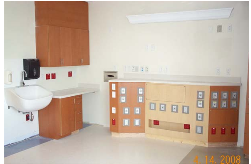
NICU Patient Room Headwall