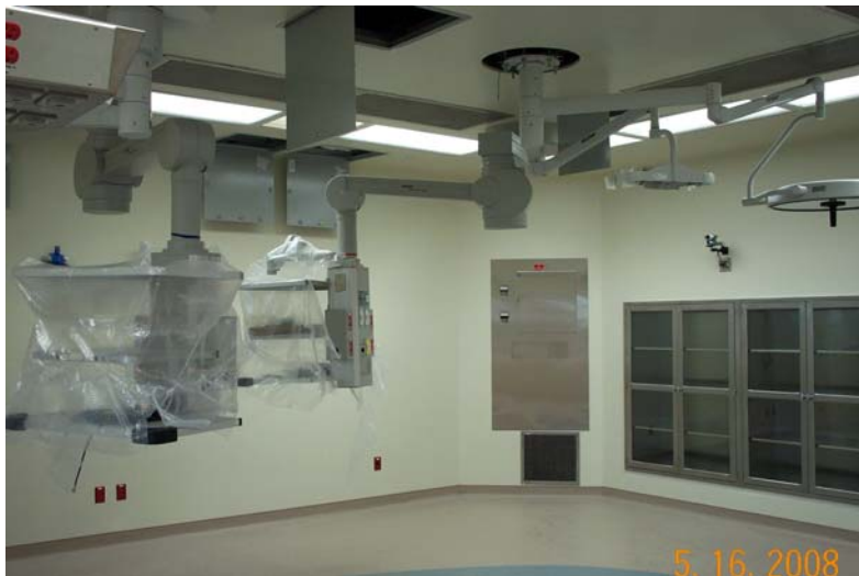
New Operating Room