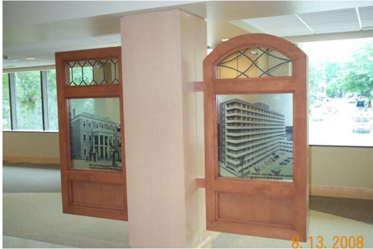
Historical Panels 1 st Floor Seating Areas