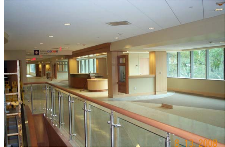
1 st Floor Concourse