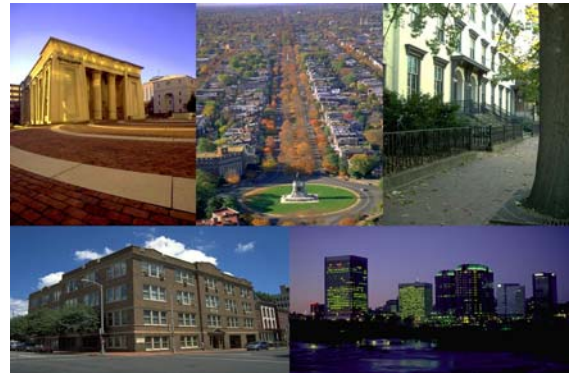
Clockwise from top left: Egyptian Building; Monument Avenue; Valentine Museum; Richmond Skyline; Virginia Mechanics Institute Building

If you have had research experience as an undergraduate student or after your graduation from college and can envision yourself with a career as a physician-scientist, we invite you to learn more about our program online at www.vcu.edu/mdphd/ .