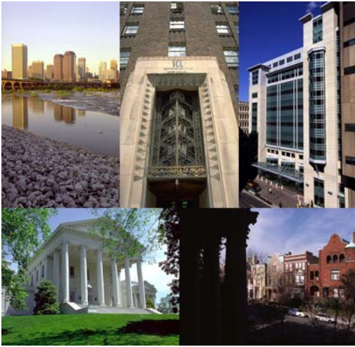
Clockwise from top left: Richmond Skyline; West Hospital Entrance; Gateway Building; West Franklin Street; Virginia State Capitol